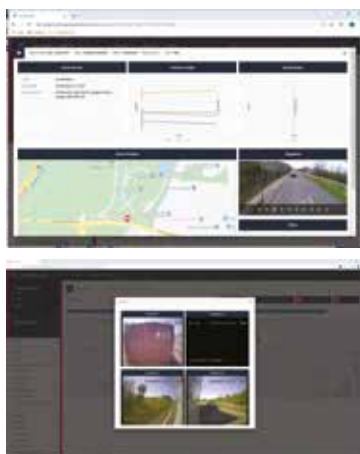
Tracks all driver data and vehicle event footage in real-time