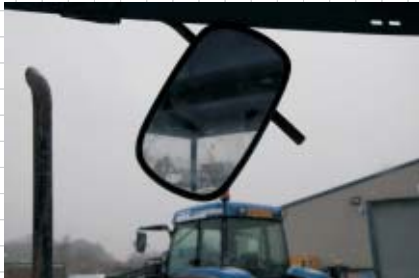
Visibility through standard flat mirrors @ 1m high