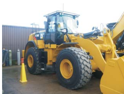
Visibility through camera system at 1 metre high