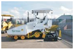
Bomag BF 300