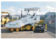
Bomag BF 300